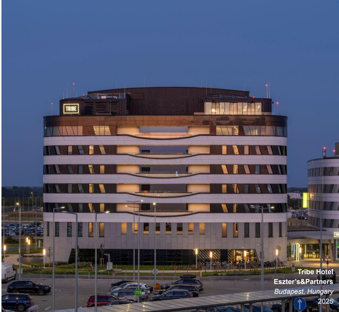
Tribe Hotel Eszter's&Partners Budapest, Hungary 2025